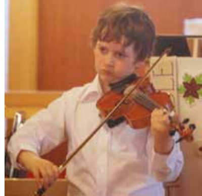
One of the young musicans(of the Suzuki Strings) playing with the Whitehorse String Ensemble evening concert – "Music on Mother's Day" in the Cathedral, on Sat., 11th May 2013.