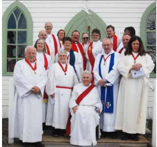
The Clergy and Lay Ministers attending at the ordination St. Martin's.