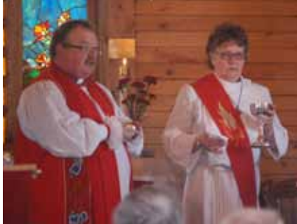
The new Deacon and the Bishop preparing to administer the bread and wine during the communion.